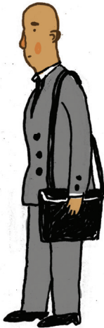
Attorney or Assigned Counsel