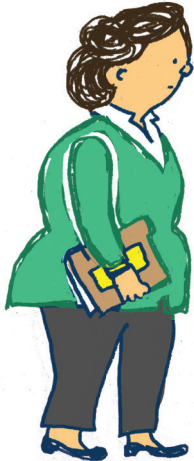
Attorney for Child (AFC) Guardian Ad Litem (GAL) Court-Appointed Special Advocate (CASA) Family/Victim Advocate