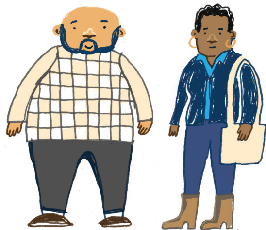
Child Protective Services (CPS)

You can put these stickers on the courtroom drawing on pages 30-31.