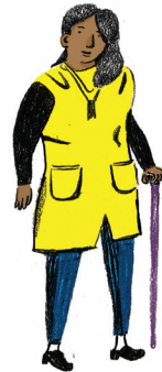
Court-Appointed Special Advocate (CASA)