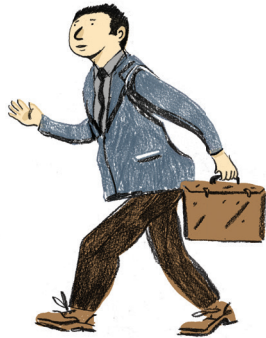
Attorney for Child (AFC)