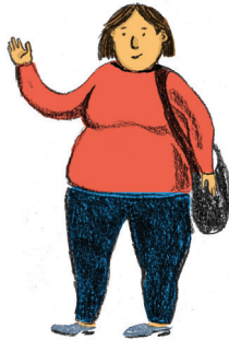
Guardian Ad Litem (GAL)