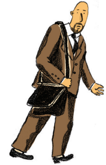
Attorney or Assigned Counsel