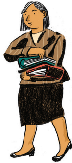
Child Protective Services Lawyers