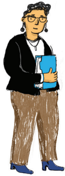
Child Protective Services (CPS)

You can put these stickers on the courtroom drawing on pages 12-13.